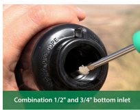
Combination 1/2" and 3/4" bottom inlet