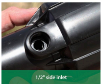
1/2" side inlet